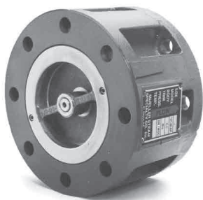
Model 101M, 103M