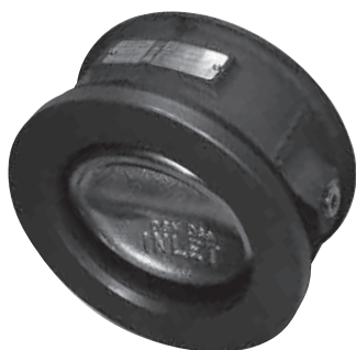
Model 1600 Front